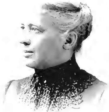
MARGARET ELIZABETH SANGSTER.